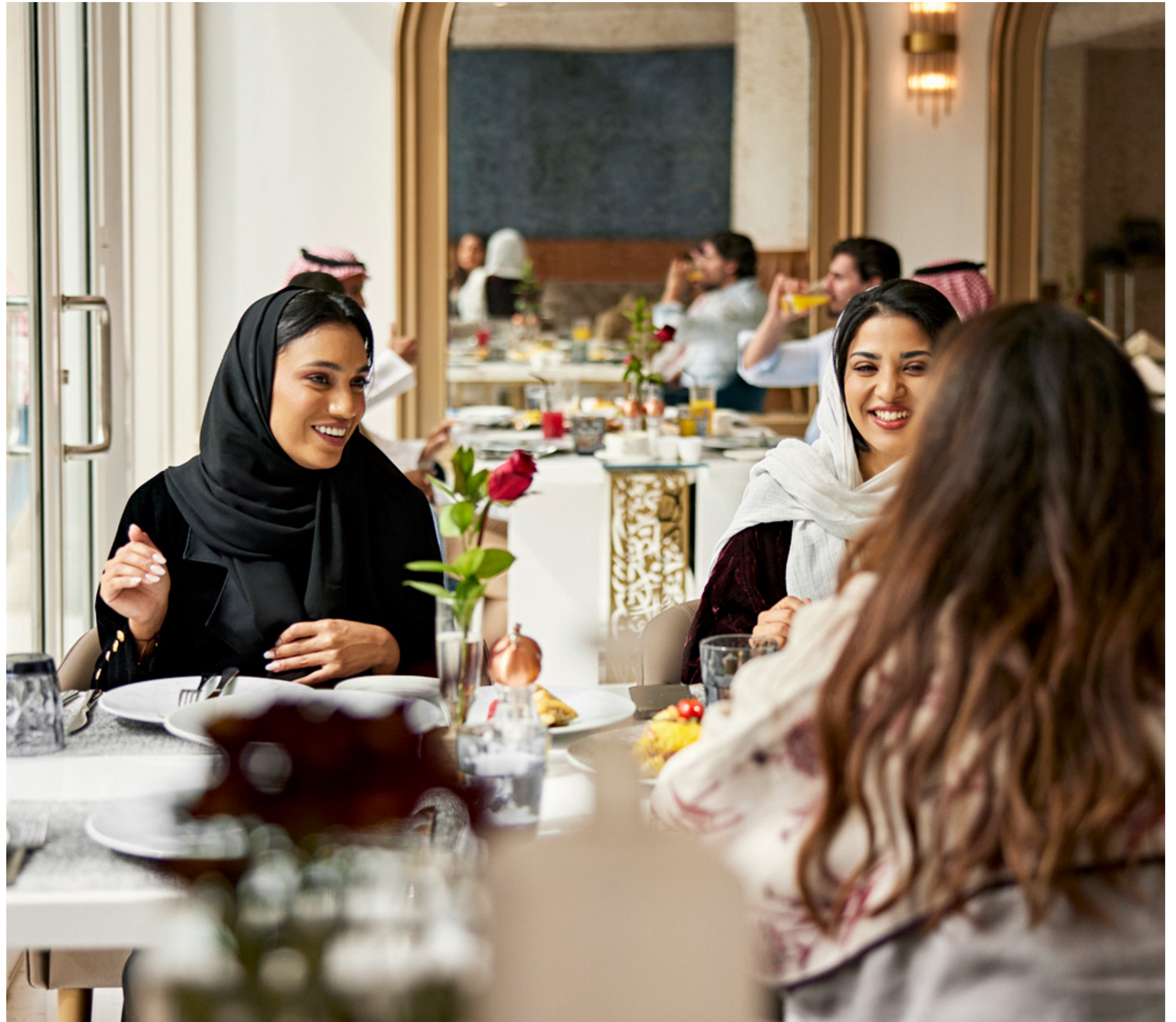
Retail & Dining